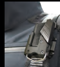
For vertical harness belts