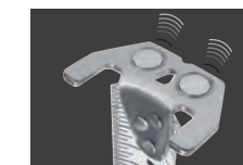
HORNED MAGNETIC HOOK™ Neodymium magnet ( 260 mT ) Magnet feature enables solo work