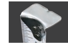
STRONG HOOK™ Thickness 1.6 mm 4.7 times stronger than standard model.