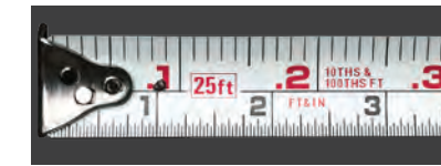
ENGINEER'S SCALE™ Graduated in decimal feet ( 10ths and 100ths )