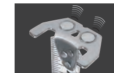
HORNED MAGNETIC HOOK™ Neodymium magnet ( 260 mT ) Magnet feature enables solo work