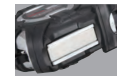
STRONG MAGNETIC MOUNT™ Neodymium magnet ( 340 mT ) specially built-in the body. Attaches firmly to single pipe and LGS.