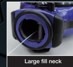
Large fill neck

Located on both sides for secure storing