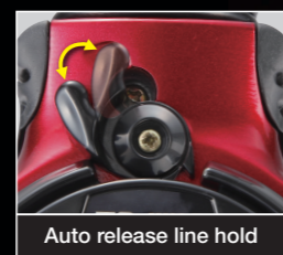
Auto release line hold

Introducing new chalk lines, "STURDY" series, designed for total robustness.