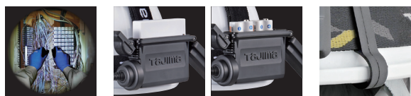
FLOOD BEAM™ Takes both rechargeable battery or AA batteries power source Helmet clips