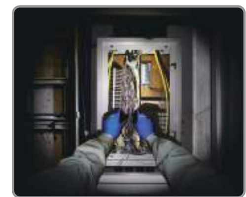
It's Wide-Angle beam