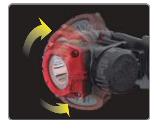
Angle Adjustment Function