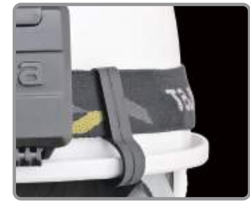
Helmet clip to prevent headband slippage