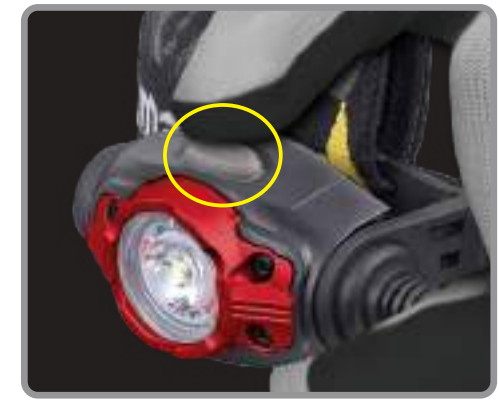
Switching 3 modes: 50 lm, 250 lm and 500 lm, by pushing the button