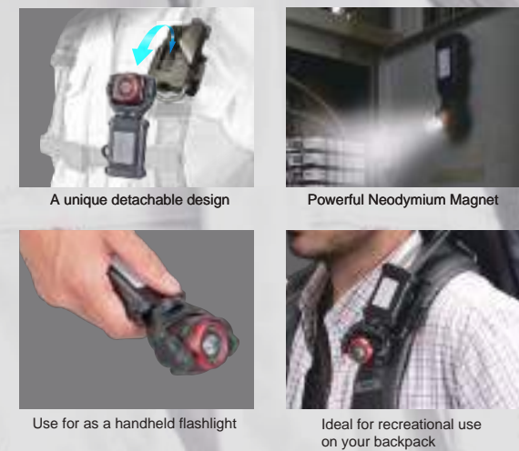
A unique detachable design Powerful Neodymium Magnet Use for as a handheld flashlight Ideal for recreational use on your backpack

WIDE-ANGLE BEAM 350 lm GRATI-LITE™ LE-SF351D