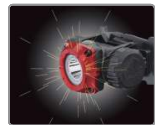
When the battery runs low, the light itself flashes as a warning