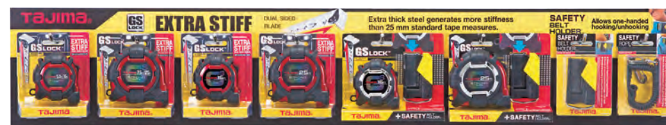
GS-16/5MBW GS-25/7.5MBW GS-16BW GS-25BW GSSF-16BW GSSF-25BW SF-BHLD AZS-ROP

Thick elastomer case armor extends around the body of the tape measure to protect end hooks and work surfaces.