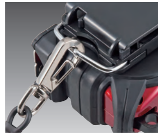
Safety belt holder end (SF-BHLD)

For attached tool weights up to 20 oz (567g) Standard overall length (including halter snap): 420mm Max. extended length (including halter snap): 1500mm Rope tether diameter: 3.2mm (polyurethane resin) Core diameter: 0.8mm (Vectran*)